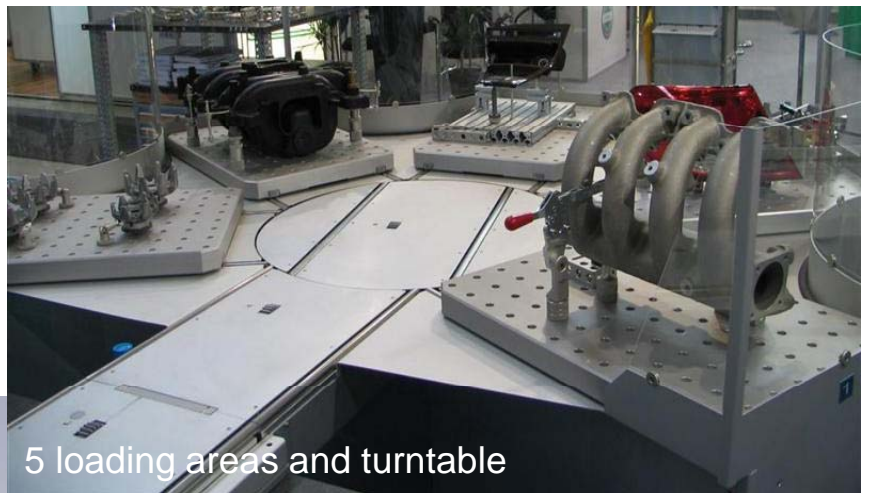
5 loading areas and turntable