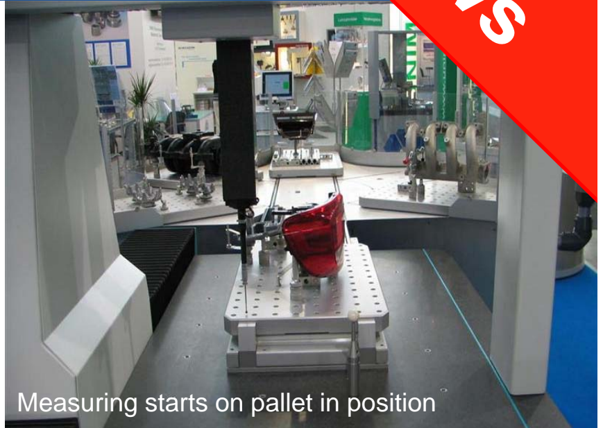
Measuring starts on pallet in position

Fast workpiece exchange is necessary to maximize machine running times. Numerous loading and feed systems are already on the market, however these are normally manually operated. To accelerate the entire process of workpiece exchange and reduce standing times of measuring machines to a minimum, Witte has developed an automatic loading system. It can be equipped with three, four, five or more pallets and/or preparation/parking areas as application demands. Depending upon requirements and space conditions the system can be circular, shelf, paternoster, shuttle or bridge type. Transfer from preparation/park position to measuring machine is possible via turntables, transfer tables and levelling systems. Depending upon type of measuring machine pass-through systems for in line measuring operations can be integrated. While the machine is continuously measuring, pallets in loading position are prepared with further work pieces. Once measuring is finished pallets mounted with the next work piece/s are exchanged independently via PC control. Selection of a certain pallet as well as automatic work piece recognition take place e.g. by means of bar code or RFID. The plates are moved