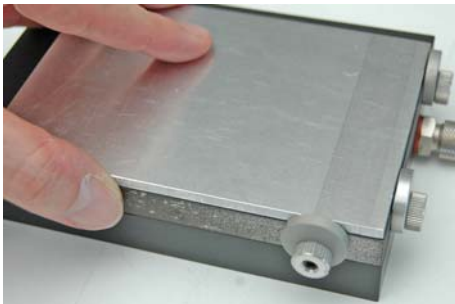
Fig. 5: Clamping the workpiece